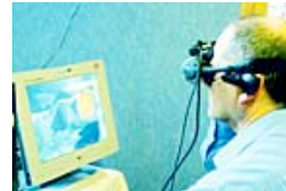
The Sonarion-Hadassah system for pain relief through images.