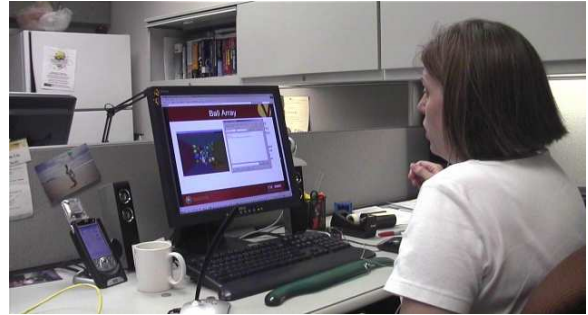
Figure 1. The tele-rehabilitation therapist is communicating with the patient via the AudioPeer system while monitoring his actions and progress on the screen.

The unsatisfactory deployment of IP Multicast has motivated researchers to propose a number of application-level multicast protocols. Such protocols only make use information provided at the application level to transmit data. Many-to-many protocols can be classified into mesh based (e.g. Narada [5]), tree based (e.g., Yoid [7] and our proposed ACTIVE), cluster based (e.g., NICE [1]) and Distributed Hash Table (DHT) based architectures (e.g., Pastry/Scribe [4]). All the application-level multicast protocols fail to recognize the feasibility of constructing a more efficient topology if the aggregation of audio packets is allowed along the delivery path.