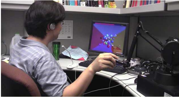
Figure 2. The remote patient is using the PHANTOM to grasp and maneuver a small cube through a three dimensional maze of spheres ('Ball Array' exercise).